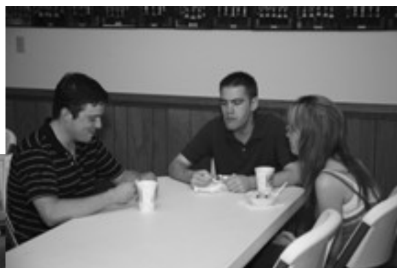
Annual Ice Cream Social