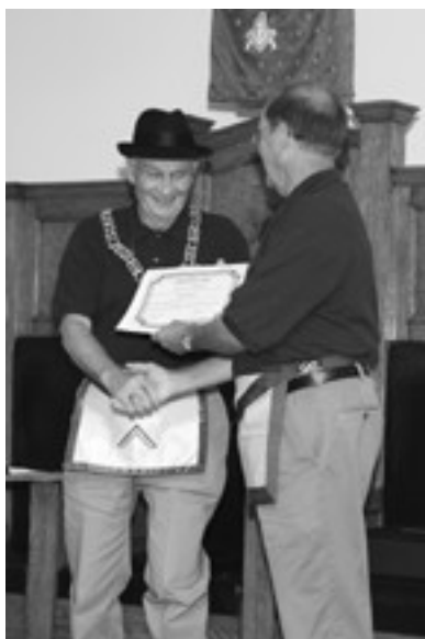
Recognition from the Masonic Home ←