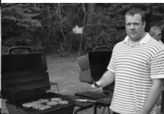
Annual Lodge Picnic