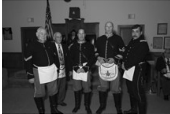
Re-enactors helping with degree work in April.