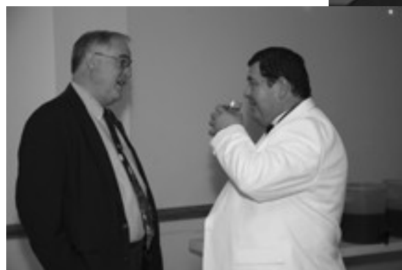
Bremond's 125th Anniversary celebration held at the Scottish Rite in June